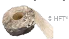
Weld Backing Tape®