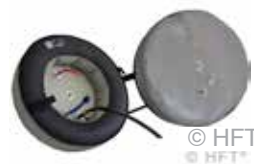
Weld Purge Dams