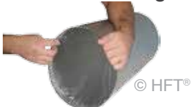
Water Soluble Weld Purge Film® & Super Adhesive®