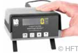
PurgEye® 500 Desk