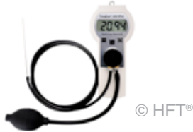
PurgEye® 100 Hand Held IP65