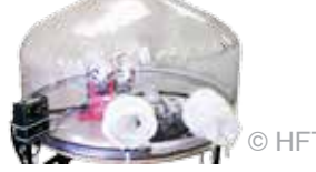
Flexible Welding Enclosures®