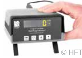
PurgEye® 500 Desk