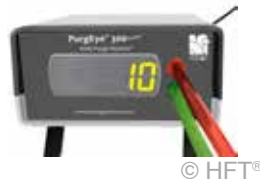
PurgEye® 300 Nano