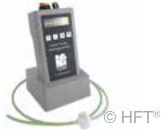
PurgEye® 200, Site and 1000