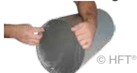
Water Soluble Weld Purge Film® & Super Adhesive®