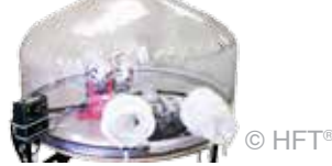
Flexible Welding Enclosures®