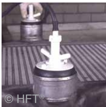
Hollow shaft plugs being prepared for testing an intercooler

These plugs all have hollow shafts with 0.5" BSP threads for the connection of an air hose.