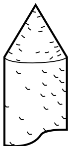
2% Thoriated Tungsten showing risk of uneven thoria distribution