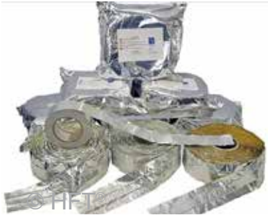
Argweld® Weld Backing Tape®