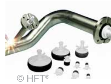
Argweld® Weld Purge Plugs™