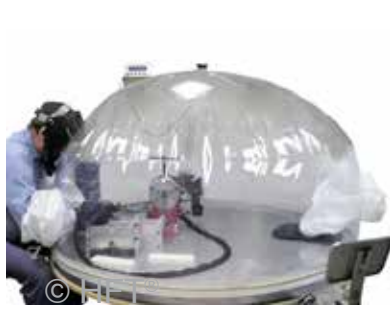
Argweld® Flexible Welding Enclosure®