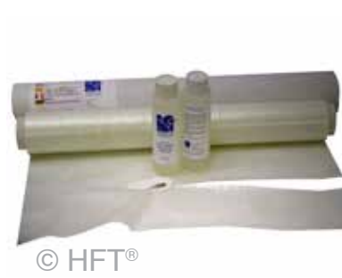
Argweld® Water Soluble Weld Purge Film®